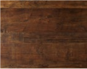
BARN OAK, NOBLE