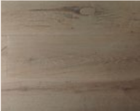
BARN OAK, COLONIAL GREY