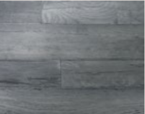
BARN OAK, GREY ASH