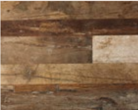
BARN OAK, RAW