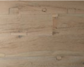
BARN OAK, GREY STONE