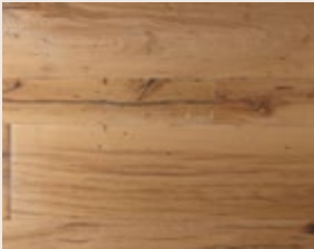
BARN OAK, PURE ASH