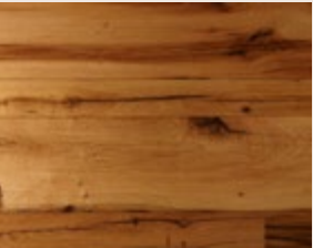
BARN OAK, COLONIAL