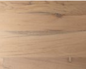
BARN OAK, COLONIAL PURE