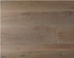
BARN OAK, WHITE ASH