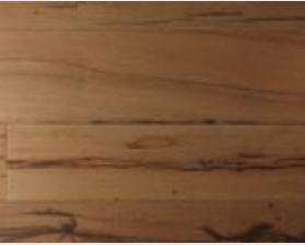
BARN OAK, PURE STONE