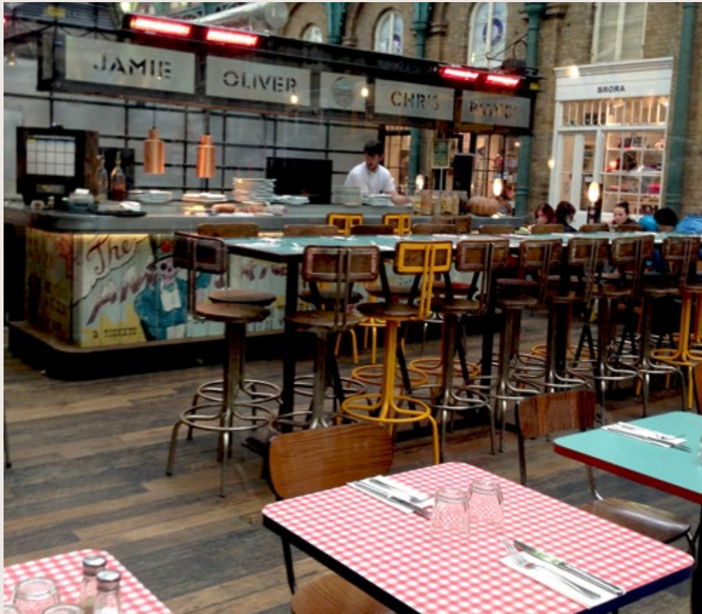
JAMIE OLIVER - LONDON, UK - Oak, Noble - Natural Oil Finish

imondi was the first company in China to win the Architizer A+ Awards | Products + Sustainability category; nominated as “Global Architecture’s most sustainable product of 2014”. imondi has become a byword for innovative, design-driven and sustainable wood flooring. Over the past few years, imondi has been wood flooring supplier of choice in award-winning architectural projects globally. We like to say that “imondi tells the story in every piece of wood”.