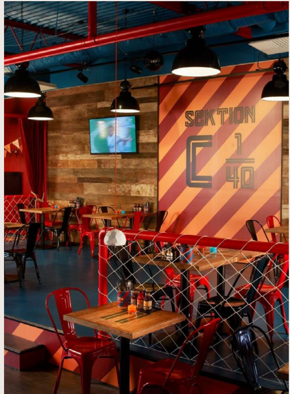
STARS & STRIPES GRILL - STOCKHOLM, SWEDEN - Oak, Raw - Unfinished