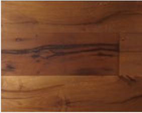
BARN OAK, STONE